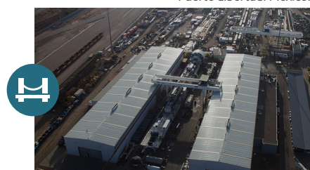
Quito Metro. Ecuador.