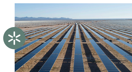
Puerto Libertad. Mexico.