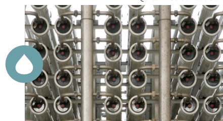
Shuqaiq 3. Saudi Arabia.