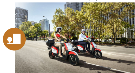
Scooter sharing service. Spain and Portugal.